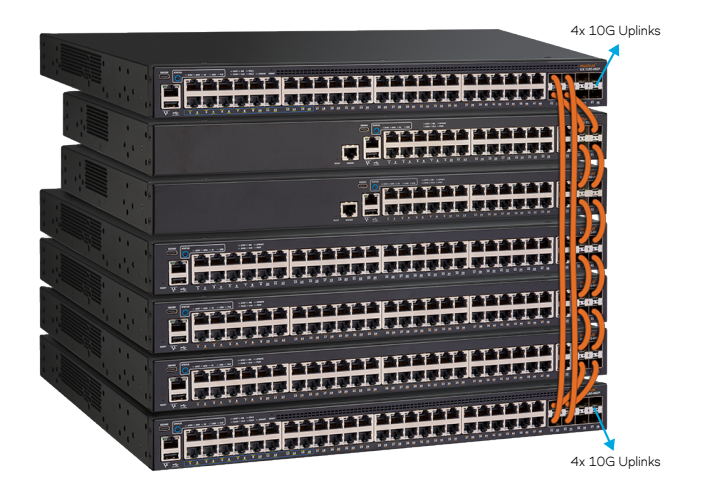
Figure 1: Up to 12 Ruckus ICX 7150 Switches can be stacked together using up to four SFP+ 10 Gbps ports per switch for a fully redundant backplane delivering 480 Gbps of aggregated stacking bandwidth.