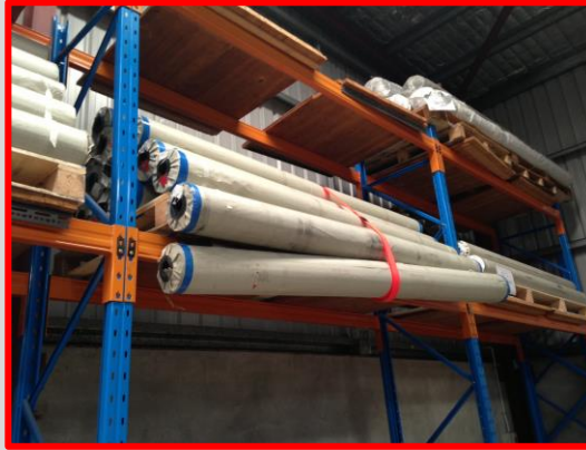
Warehouse product securing