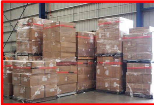
Horizontal pallet strapping