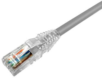
NPC RJ45 Patch Cord, category 6, Unshielded, CM (PVC), Gray