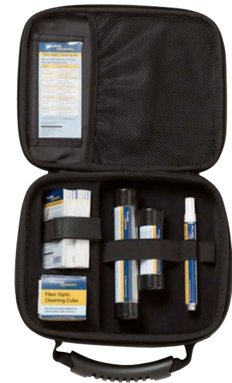
Fiber Optic Cleaning Kit NFC-Kit-Case

Insert the swab into the port and turn several times while applying gentle pressure. Follow the damp swab with a dry one, using the same procedure to remove any remaining solvent from the end-face and alignment sleeve.