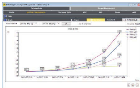
Historical trend data of batteries.