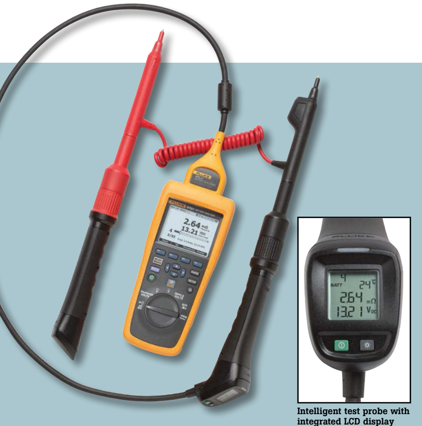
Intelligent test probe with integrated LCD display

Reduced testing complexity, a simplified workflow and an intuitive user interface provide a new level of ease-of-use in battery testing.